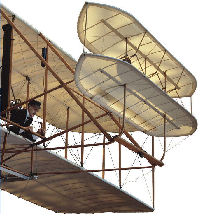
1903 Wright Flyer