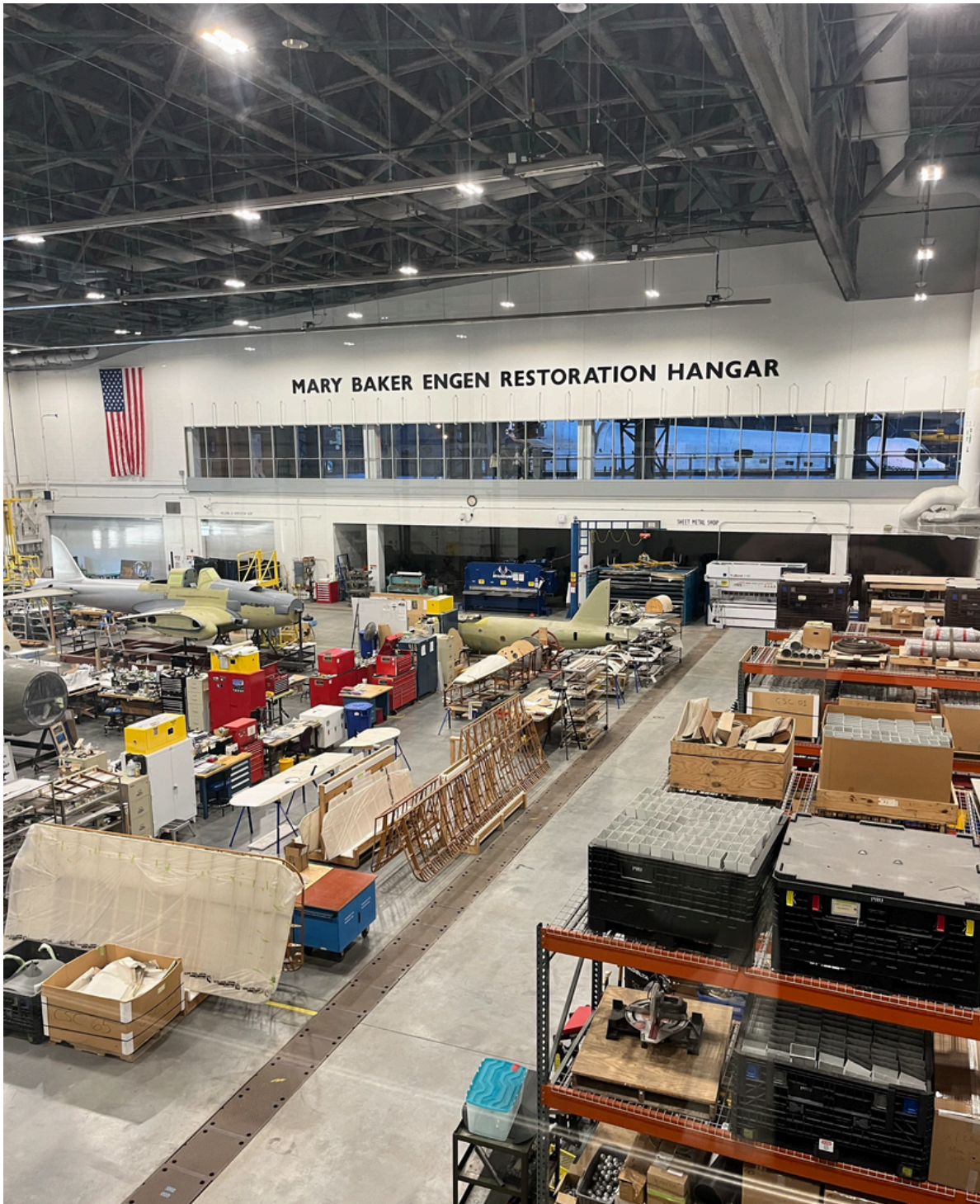
The Mary Baker Engen Restoration Hangar is a large space where the Museum's staff and Volunteers restore aircraft. From a glassed-in mezzanine, I can view restoration projects in progress.